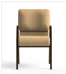
AW 101 - Mixed Tan