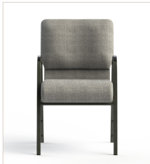
AW 19 - Charcoal