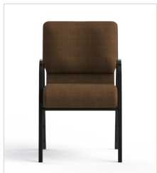
AW 29 - Espresso