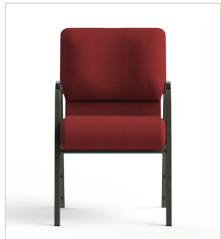
AW 16 - Maroon