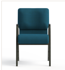
AW 05 - Dark Blue