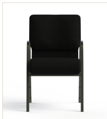
AW 21 - Black