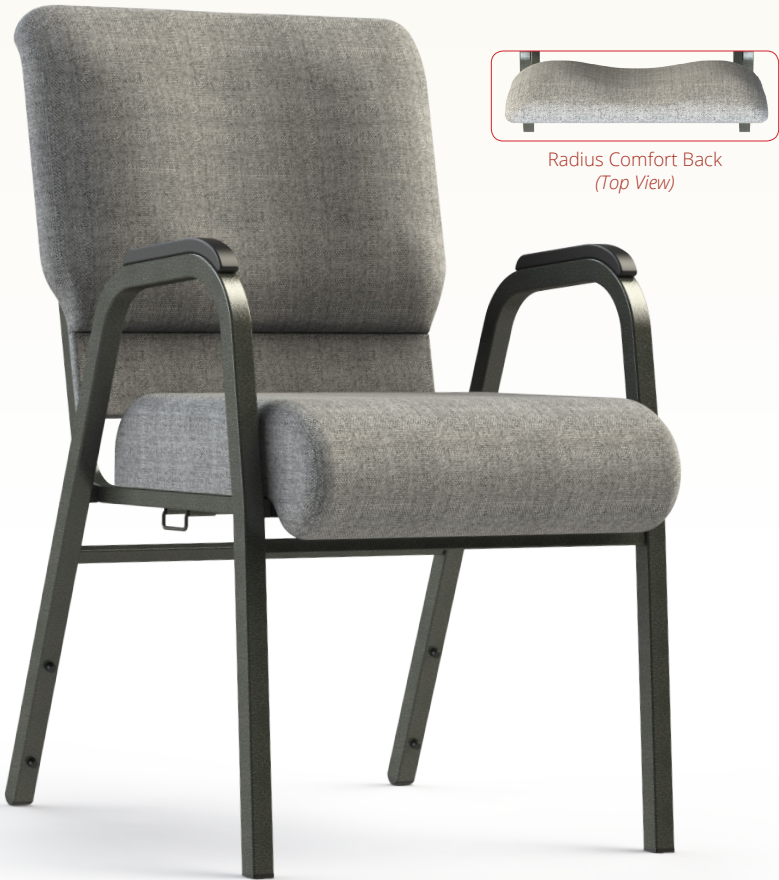
Radius Comfort Back (Top View)